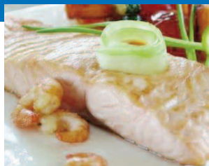
An example of the development of total flora in a ready meal made with cooked fish

Associated with vacuum-packing or packaging under a protective atmosphere, they slow down the growth of the spoilage flora.