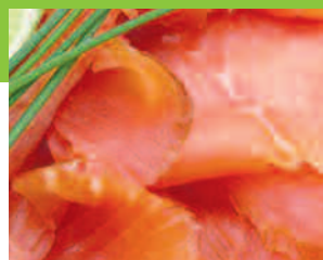
Concentration of Listeria monocytogenes in smoked salmon stored at 8°C during a challenge test

We can test the risk of Listeria in your products through challenge tests using strains from the agro-food industry in our laboratory, in order to measure the efficiency of Ferment LLO®.